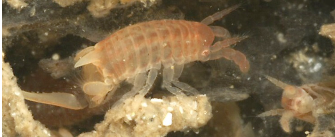
Male Chelura terebrans ; females would have much shorter uropod 3. A smaller specimen, of unknown sex, visible at the lower right