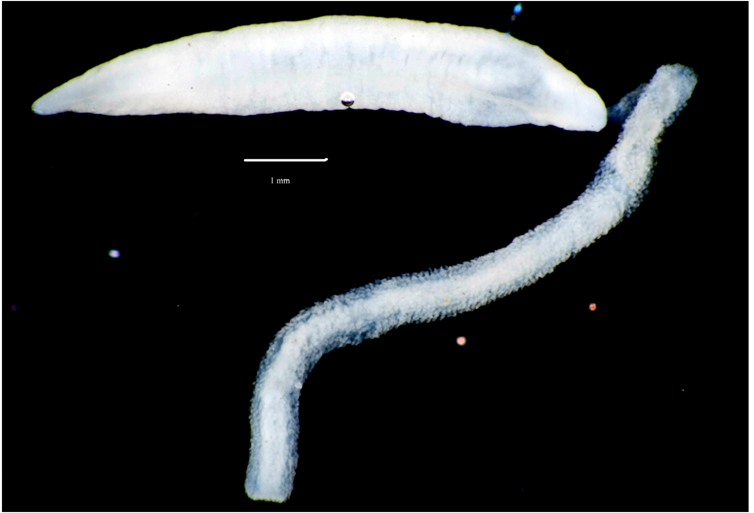
Figure 1. Hoplonemertea sp B SCAMIT. Santa Monica Bay, A2, 16 m, 28 September 2006.